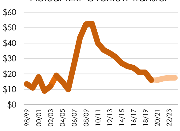
Actual TLRF Overflow Transfer

Under the California Teeter plan, the county advances to participating agencies property tax allocations based on enrolled assessed valuation. In return,